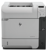
HP LaserJet Enterprise 600 Printer M601dn