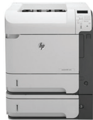
HP LaserJet Enterprise 600 Printer M603xh