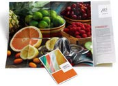
Direct mail. Large-sized poster pieces

Inline and near line finishing. Digital inline and near line finishing devices with automatic setup, instant make-ready, and automated error recovery leverage digital capabilities to achieve higher levels of productivity. Solutions include the Horizon Smart Stacker and MBO signature folder.