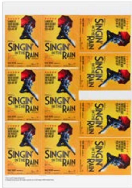
Imposition efficiency. Print A5 event flyers 10-up on a B2 sheet.