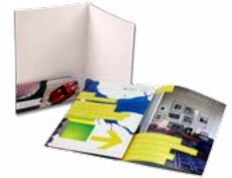
New marketing collateral possibilities. Pocket folders and 6-page folded brochures.

Use HP SmartStream products and partner solutions with the HP Indigo 10000 Digital Press to improve production efficiency and support digital growth. To learn more visit hp.com/go/smartstream