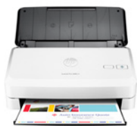
Pro 2000 s1

HP sheet-feed scanners have a small footprint to save valuable office space and handle a variety of media types.