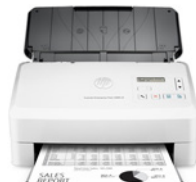
Enterprise Flow 5000 s4