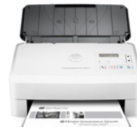
Enterprise Flow 7000 s3