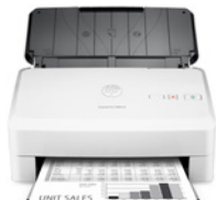
Pro 3000 s3