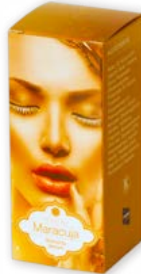
Create dramatic effects using HP Indigo ElectroInk White, on metallic, transparent and dark substrates.

When printing labels and packaging with HP Indigo presses, HP Indigo ElectroInk White creates an opaque appearance and solid backing for labels, shrink sleeves, and flexible packaging applications. This enables effective use of unique, high-value substrates including clear, metallised, and coloured.