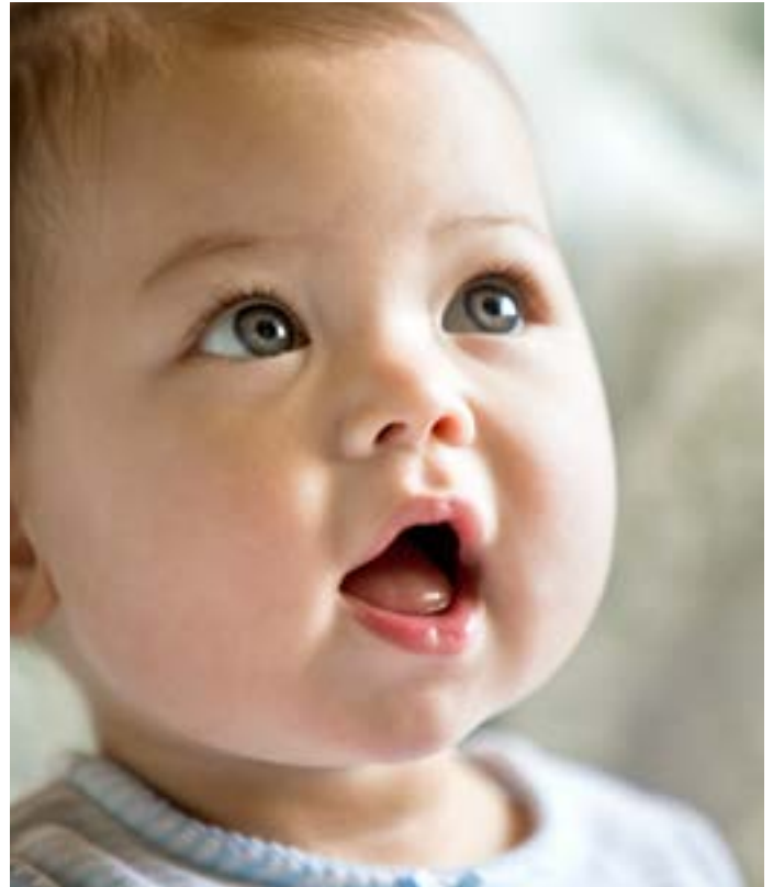
Use HP Indigo ElectroInk Light Cyan and HP Indigo ElectroInk Light Magenta for portraits to produce more natural skin tones.

Light black inks produce high-end monochrome photographic books and professional black-and-white photo prints. Achieve superior grayscale images for black and white photography and mixed colour and black and white imagery.