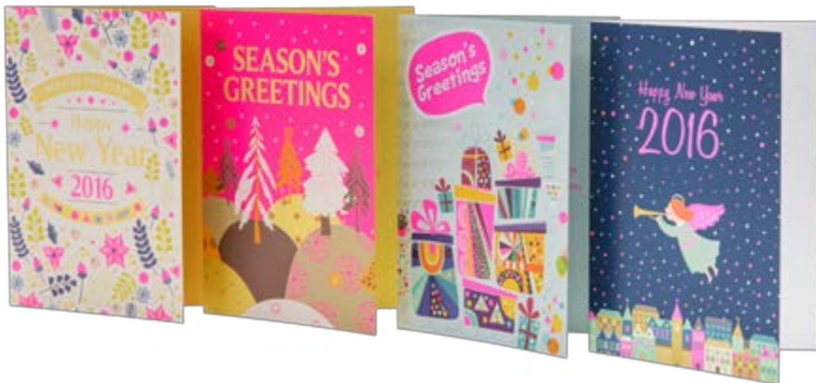
Offer high-value products with HP Indigo ElectroInk Fluorescent Pink.

Stand out and glow with HP Indigo ElectroInk Fluorescent Pink, offering high-value pages for greeting cards, promotional collateral, fashion applications, specialty products, publishing opportunities and more. For a wow effect, use UV lamps to make the fluorescent pink ink glow in the dark.