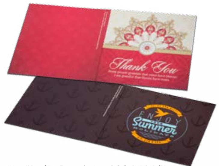
This sophisticated invitation was printed on an HP Indigo 7800 Digital Press with HP Indigo ElectroInk Digital Matte.

Graphic designers will love HP Indigo ElectroInk Digital Matte for its creative possibilities, while customers will marvel at the outstanding artistic and marketing appeal of their materials. The pieces printed with HP Indigo ElectroInk Digital Matte can also improve revenues and increase gross margins.