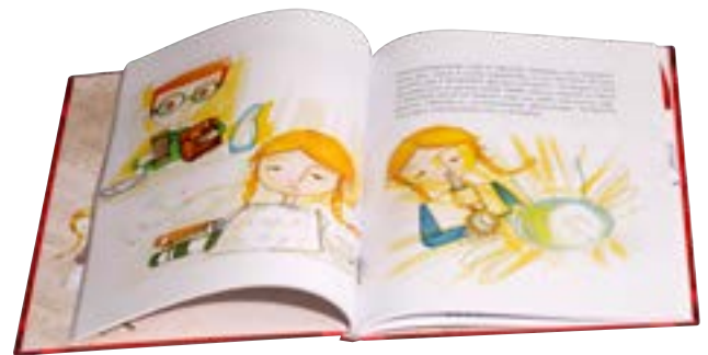
Print 33% faster using Enhanced Productivity Mode (EPM), while maintaining HP Indigo's vivid colours and high print quality.