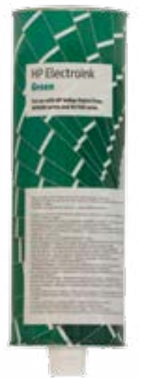
Series 3 ink cartridge