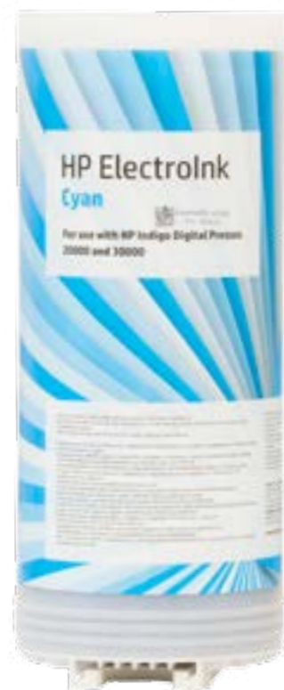
New generation ink tube made from recycled plastic

An entirely new set of supplies has been designed to support the large format 29 inch (75 cm) commercial HP Indigo 10000 Digital Press Series, the HP Indigo 20000 Digital Press for flexible