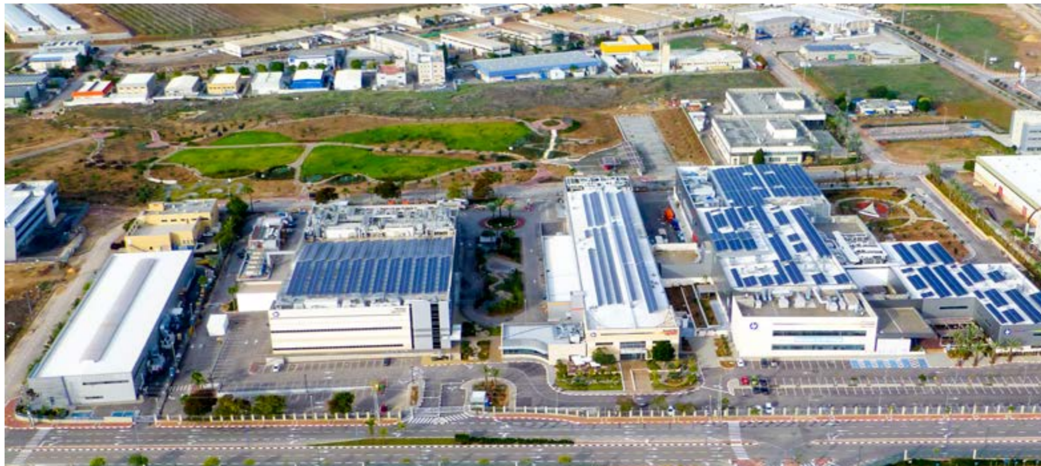
Solar panels at the Kiryat Gat campus generate photovoltaic power.