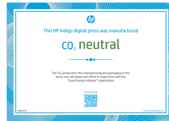
HP Indigo presses manufactured are provided with a certificate.