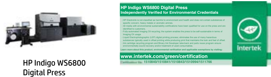
HP Indigo WS6800 Digital Press

Intertek is one of the world's leading independent certification and testing companies. HP Indigo chose the Intertek Green Leaf Mark to demonstrate rigorous, independent verification of environmental claims associated with these presses.