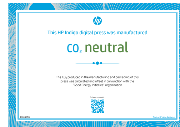
HP Indigo presses manufactured are provided with a certificate.