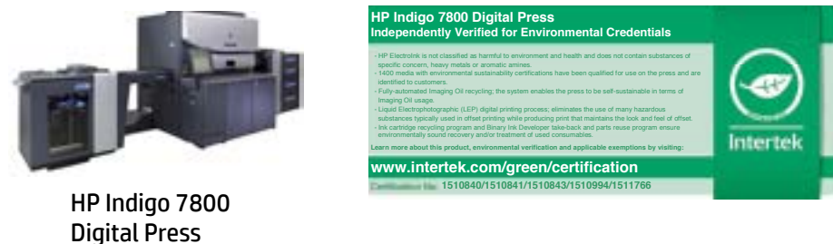
HP Indigo 7800 Digital Press

Learn more about the Intertek Green Leaf Mark at www.intertek.com/green/certification