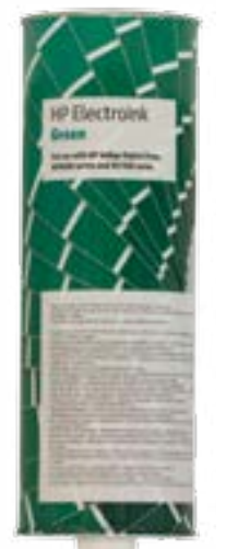
Series 3 ink cartridge