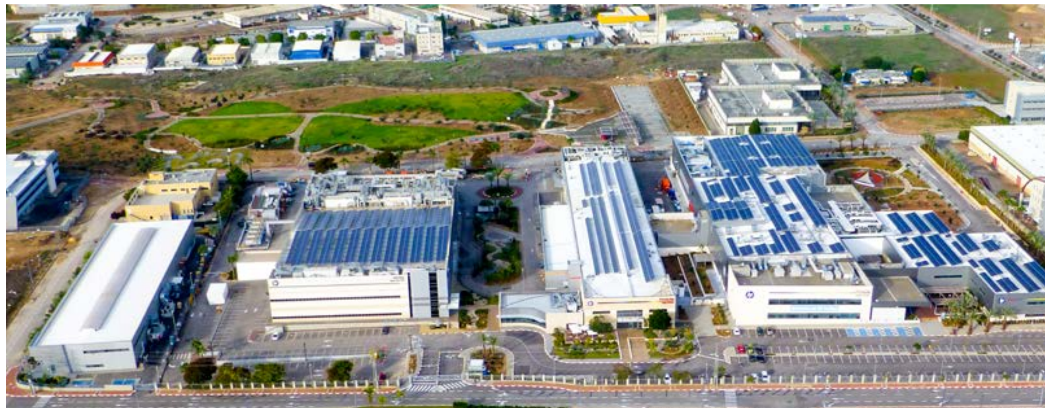
Solar panels at the Kiryat Gat campus generate photovoltaic power.