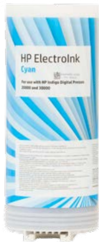
New generation ink tube made from recycled plastic

As a result of the new feature, the amount of oil waste is reduced, contributing to a smaller environmental footprint associated with use of this product.