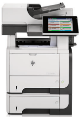
HP LaserJet Enterprise 500 MFP M525f