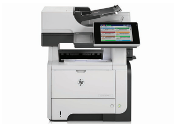
HP LaserJet Enterprise flow MFP M525c