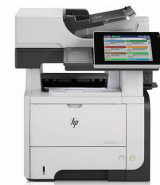
HP LaserJet Enterprise flow MFP M525c