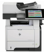
HP LaserJet Enterprise 500 MFP M525dn