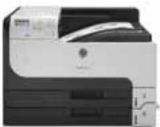
(HP LaserJet Enterprise 700 Printer M712dn)