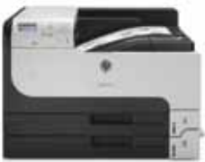
(HP LaserJet Enterprise 700 Printer M712n)