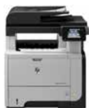
HP LaserJet Pro MFP M521dn