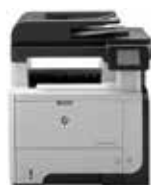
HP LaserJet Pro MFP M521dw