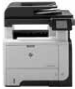
HP LaserJet Pro MFP M521dn