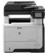
HP LaserJet Pro MFP M521dw