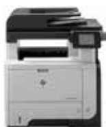
HP LaserJet Pro MFP M521dn