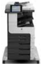
HP LaserJet Enterprise MFP M725z