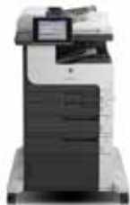
HP LaserJet Enterprise MFP M725f