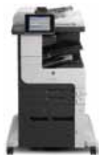
HP LaserJet Enterprise MFP M725z+