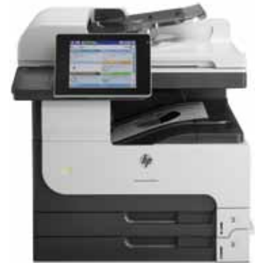
(HP LaserJet Enterprise MFP M725dn shown)

Mobile printing capability: HP ePrint, Apple AirPrint™