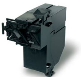
HP Embedded Spectrophotometer