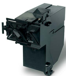
HP Embedded Spectrophotometer