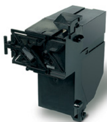
HP Embedded Spectrophotometer