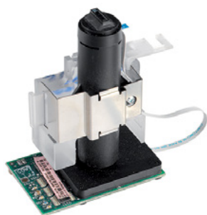
HP Optical Media Advance Sensor (OMAS)

HP Instant Printing PRO allows you to quickly preview, crop, and print in large format using one simple tool, providing a quick and easy way for reprographic and copy shops to print in large format. You can easily manage your files from one single application. Just drag and drop PDF, 7 TIFF, JPEG, PPT, 8 HP-GL/2, and DWF files to HP Instant Printing PRO to manage and preview them. Access the job queue as well as accounting information with one simple click. HP Instant Printing PRO enables true print confidence. Avoid printing on the wrong-sized media with a realistic print preview.