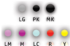
HP Vivid Photo Inks

Deliver the quality your customers expect and maintain the productivity you need. The HP DesignJet Z6200 photo printing system, including Original HP Vivid Photo Inks, HP printheads, and HP large format printing materials, is designed and engineered together to provide uncompromising image quality, consistency, performance, durability, and value—with every print.