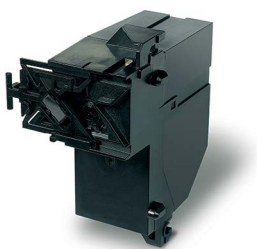
HP Embedded Spectrophotometer