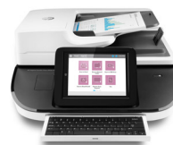
HP Digital Sender Flow Document Capture Workstation

LaserJet M527c/z, M631h, M632z, M633z, M830z; Color LaserJet M577c/z, M681z, M682z, M880z; PageWide Color 586z, 785f, 785zs, 785z+