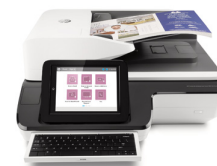
HP ScanJet Enterprise Flow Scanner

5000 s4, 7000 s3, 7500, N9120, N9120 fn2