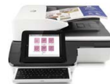
5000 s4, 7000 s3, 7500, N9120, N9120 fn2