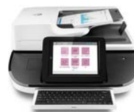
8500 fn1, 8500 fn2