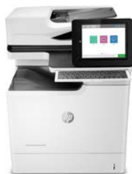
LaserJet M527c/z, M631h, M632z, M633z, M830z; Color LaserJet M577c/z, M681z, M682z, M880z; PageWide Color 586z, 785f, 785zs