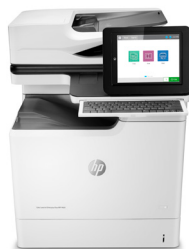
HP LaserJet/PageWide Enterprise Flow MFP

LaserJet M527c/z, M631h, M632z, M633z, M830z; Color LaserJet M577c/z, M681z, M682z, M880z; PageWide Color 586z, 785f, 785zs, 785z+