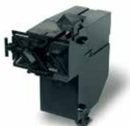
HP Embedded Spectrophotometer

The HP Embedded Spectrophotometer , with i1 Colour Technology from X-Rite, is mounted on the printer carriage for accurate printer calibration measurements that deliver print-to-print and printer-to-printer colour consistency and accuracy. It revolutionises professional colour workflows by enabling the creation of media profiles.