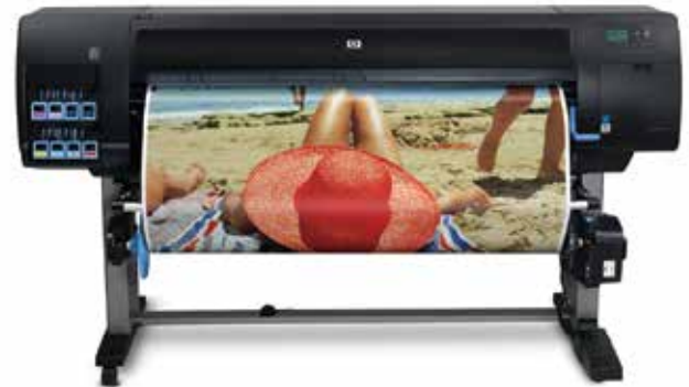
HP Designjet Z6200 Photo Printer series

The fastest production printer 1 for graphics with unrivaled print quality