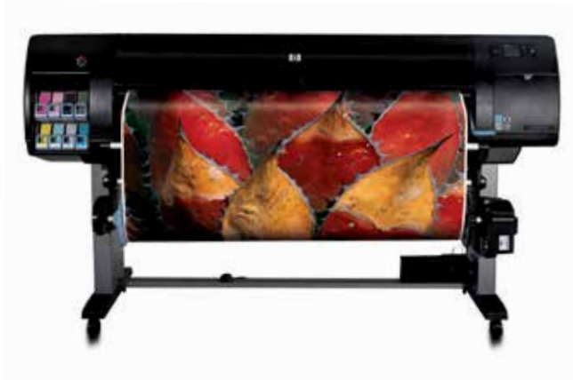
HP Designjet Z6100 Photo Printer series

From HP Designjet Z6100 Photo Printer series to HP Designjet Z6200 Photo Printer series