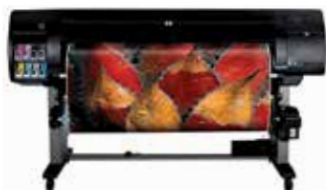
HP Designjet Z6100 Photo Printer series