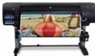
HP Designjet Z6200 Photo Printer series