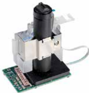
HP Optical Media Advance Sensor (OMAS)

HP Double Swath Technology provides breakthrough speed and performance. The HP Designjet Z6200 Photo Printer series includes two sets of four HP 771 Designjet Printheads, creating a wide print swath—up to 1.67-inches/42.5 mm—and a high firing frequency to deliver prints with amazing speed. Four bi-color printheads feature 1,056 nozzles per color, 1,200 nozzles per inch, and small drop volumes for top photo quality.