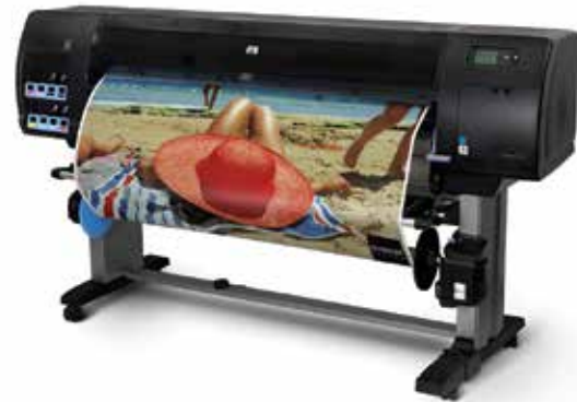
HP Designjet Z6200 Photo Printer series

The fastest production printer 1 for graphics with unrivaled print quality