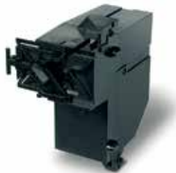
HP Embedded Spectrophotometer

The HP Embedded Spectrophotometer , with i1 Color Technology from X-Rite, is mounted on the printer carriage for accurate printer calibration measurements that deliver print-to-print and printer-to-printer color consistency and accuracy. It revolutionizes professional color workflows by enabling the creation of media profiles.