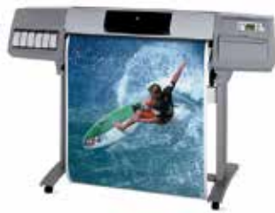
HP Designjet 5000/5500 Printer series