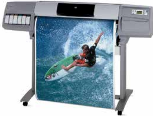
HP Designjet 5000/5500 Printer series

From HP Designjet 5000/5500 Printer series to HP Designjet Z6200 Photo Printer series