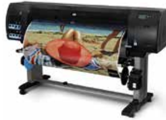
HP Designjet Z6200 Photo Printer series