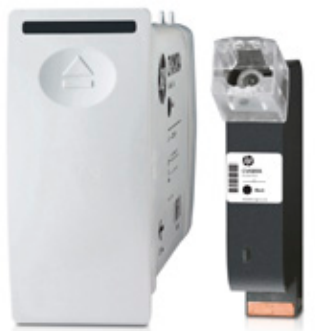
Bulk ink cartridge