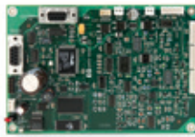
IDS interface board

IDS interface board. This electronic board mounts on the modular ink supply stall assembly and enables access to ink level sensing and other advanced ink cartridge features. Each board controls up to four modular ink supply stall assemblies. Incorporating this board into the design increases printing system functionality and reliability. For example, it can confirm ink cartridge compatibility, deliver "low ink" warnings, or enable hot swapping of ink cartridges.