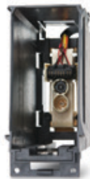
Modular ink supply stall assembly

Modular ink supply stall assembly. This component provides easy mounting of the bulk ink cartridge, as well as proper electrical and mechanical connection every time the cartridge is changed. When multiple ink cartridges are required, simply snap together as many modular ink supply stall assemblies as needed.