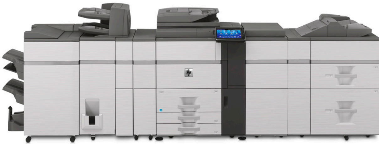
HP Color MFP S970dn example configuration