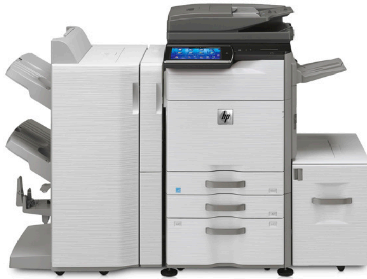
HP MFP S956dn example configuration