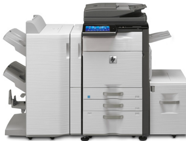
HP Color MFP S951dn example configuration