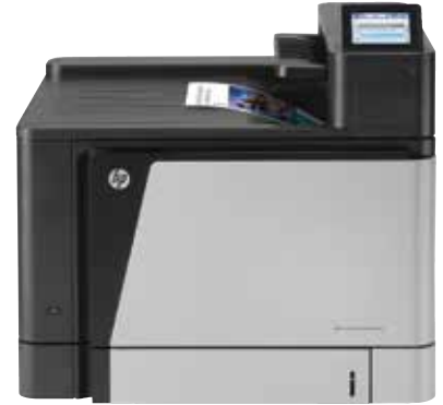
HP Color LaserJet Enterprise M855dn Printer

Mobile printing capability: 11 HP ePrint; Apple AirPrint™; Mobile Apps; HP Wireless Direct printing (optional)