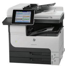
HP LaserJet Enterprise MFP M725dn

Enable large-volume printing on a wide range of paper sizes—up to A3—with a 4600-sheet maximum input capacity. 2 Preview and edit scanning jobs. Centrally manage printing policies. Safeguard sensitive business information.