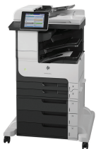
HP LaserJet Enterprise MFP M725z