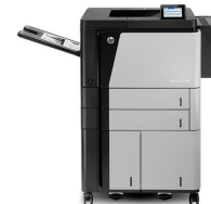
HP LaserJet Enterprise M806x+ Printer