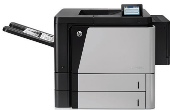
HP LaserJet Enterprise M806dn Printer

This HP LaserJet handles big print jobs fast, with extra-large input capacity and versatile paper-handling options. Mobile printing is simple with wireless direct printing and touch-to-print technology. Easy upgrades protect your investment. 1,2