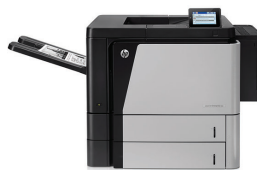
HP LaserJet Enterprise M806dn Printer