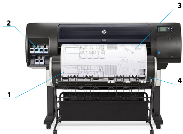
HP DesignJet T7200 Production Printer