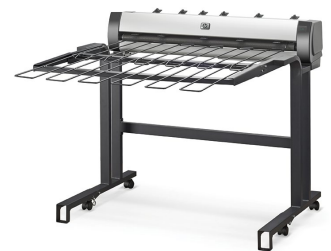
HP DesignJet Stacker