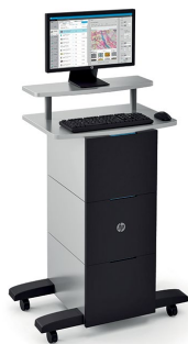
HP SmartStream software