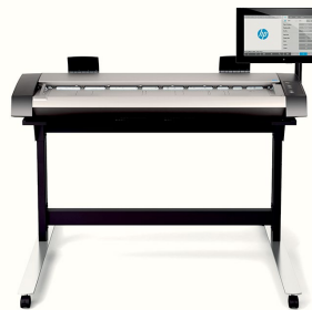
HP DesignJet HD Pro Scanner