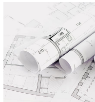
CAD drawings (color and black-and-white)

You can use the HP DesignJet T7200 Production Printer to print any combination of applications on a wide range of media from bond paper to glossy photo paper for maximum versatility including: