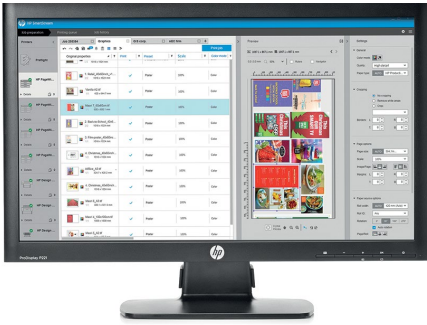
HP SmartStream software

Boost overall production with a high-speed printer that offers a range of efficiency-enhancing accessories like an online folder, external stacker, and scanner.