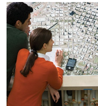
Maps and orthophotos