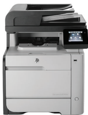
HP Color LaserJet Pro MFP M476nw

This HP Color LaserJet Pro MFP connects the whole office to vibrant color printing, even on the go 1,3,4 —and improves productivity with fast, versatile scanning that can send documents directly to email, network folders, and the cloud.