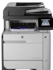
HP Color LaserJet Pro MFP M476dw