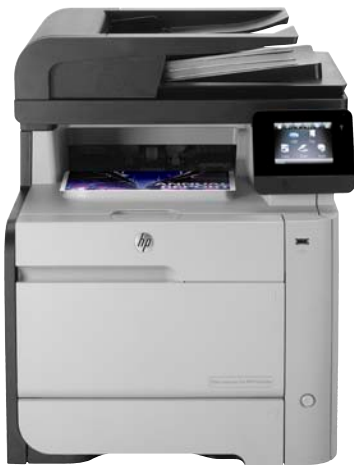
HP Color LaserJet Pro MFP M476 series

This HP Color LaserJet Pro MFP connects the whole office to vibrant color printing, even on the go 1,3,4 —and improves productivity with fast, versatile scanning that can send documents directly to email, network folders, and the cloud.