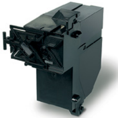
Spectrophotometer with i1 color technology from X-Rite