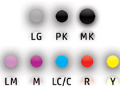
HP Vivid Photo Inks