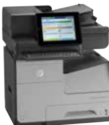
HP Officejet Enterprise Color Flow MFP X585z