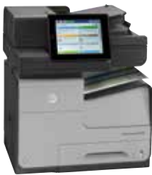
HP Officejet Enterprise Color MFP X585dn

A printing revolution for business. HP Officejet Enterprise MFPs deliver colour prints at up to twice the speed and half the cost per page of colour lasers plus copy, scan, and fax. 1,2,8 They're designed for advanced workflow—and built to last.