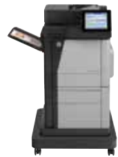
HP Color LaserJet Enterprise MFP M680f