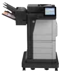
HP Color LaserJet Enterprise Flow MFP M680z