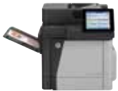
HP Color LaserJet Enterprise MFP M680dn

Tackle high-volume jobs with a high-performance colour MFP. Print and copy on letter and A4, plus scan and fax. Enhanced scanning and an 8-inch colour touchscreen streamline workflows. Mobile printing options help you stay productive on the go. 2,8