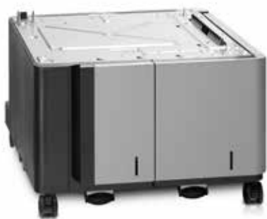
HP LaserJet 3500 sheet HCL and Stand (C3F79A)

1 HP Auto-On/Auto-Off Technology capabilities subject to printer and settings; may require a firmware upgrade.