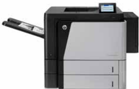
HP LaserJet Enterprise M806dn Printer

This HP LaserJet handles big print jobs fast, with extra-large input capacity and versatile paper-handling options. Mobile printing is simple with wireless direct printing and touch-to-print technology. Easy upgrades protect your investment. 1, 2