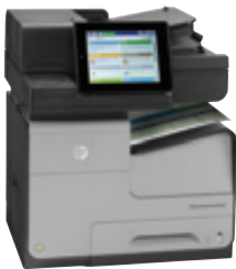
HP Officejet Enterprise Color MFP X585dn

A printing revolution for business. HP Officejet Enterprise MFPs deliver color prints at up to twice the speed and half the cost per page of color lasers plus copy, scan, and fax. 1,2,8 They're designed for advanced workflow—and built to last.