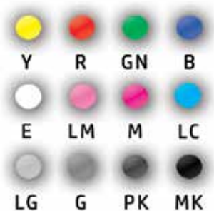
HP Photo Inks for the HP Designjet Z3200 Photo Printer series