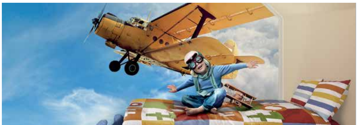
Photo wall murals