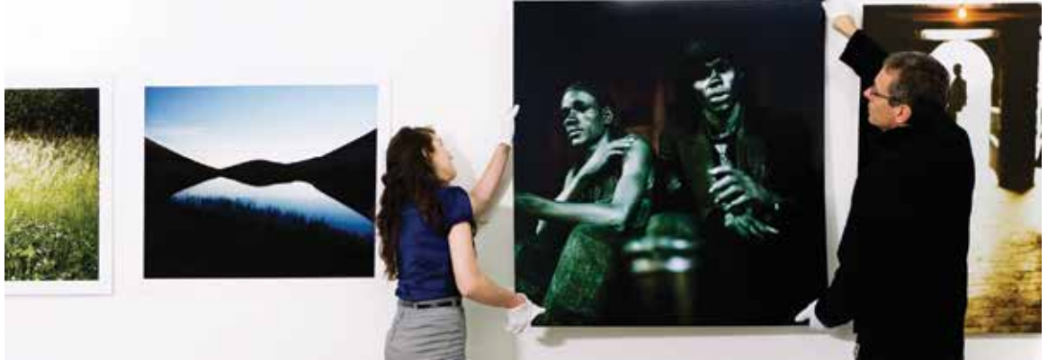
Exhibit the fine art of printing

Produce dazzling professional photography and fine art reproductions. Long lifespan and fade resistance keep prints in top viewing condition on a range of printing materials from canvas to fine art photo papers.