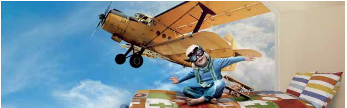
Photo wall murals