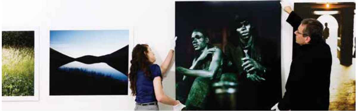
Exhibit the fine art of printing

Produce dazzling professional photography and fine art reproductions. Long lifespan and fade resistance keep prints in top viewing condition on a range of printing materials from canvas to fine art photo papers.