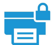
3 Secure keys, passwords, and certificates