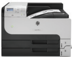
(HP LaserJet Enterprise 700 M712dn Printer)

Enable high-volume, black-and-white printing on paper sizes up to A3—and capacity up to 4,600 sheets. 1 Control costs with energy-saving features and two-sided printing. Protect sensitive business data and centrally manage printing policies.