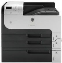
(HP LaserJet Enterprise 700 M712xh Printer)