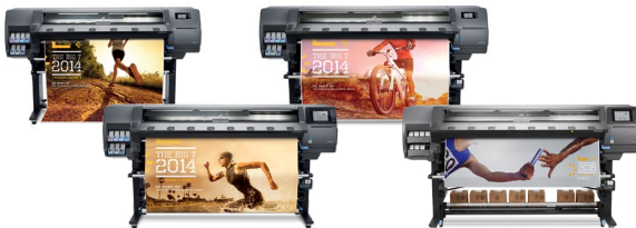
HP Latex 360 Printer