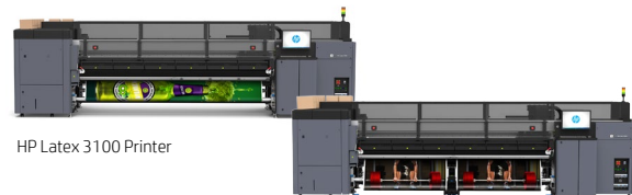
HP Latex 3100 Printer