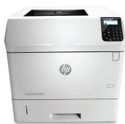
HP LaserJet Enterprise M604n

Keep business moving and produce outstanding print quality. Tackle large jobs and equip workgroups for success—wherever business leads. 2 Easily manage and expand this fast, versatile printer—and help reduce environmental impact.