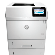
HP LaserJet Enterprise M605x