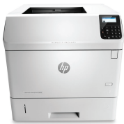
HP LaserJet Enterprise M605dsh