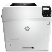
HP LaserJet Enterprise M604dn

Keep business moving and produce outstanding print quality. Tackle large jobs and equip workgroups for success—wherever business leads. 2 Easily manage and expand this fast, versatile printer—and help reduce environmental impact.