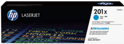
Original HP Toner cartridge with JetIntelligence

Original HP Toner cartridges with JetIntelligence give your business more pages, 3 peak printing performance, and the added protection of anti-fraud technology—something the competition can't match.