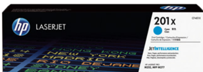
Original HP Toner cartridge with JetIntelligence

Original HP Toner cartridges with JetIntelligence give your business more pages, 3 peak printing performance, and the added protection of anti-fraud technology—something the competition can't match.