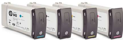
8 (2 x 775-ml per color with auto-switch)