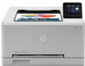
HP Color LaserJet Pro M252dw