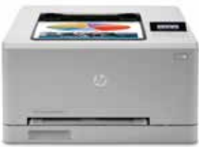
HP Color LaserJet Pro M252n

In today's fast-paced business environment, you need technology that can hit the ground running. This compact printer, combined with Original HP Toner with JetIntelligence, helps meet the needs of your business—and is ready to work when you are.