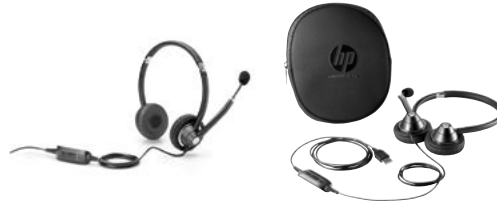
HP UC Wired Headset