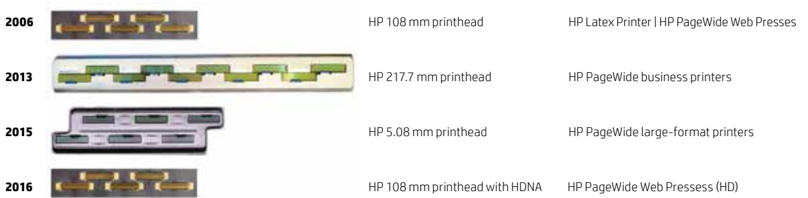
Figure 2. Four generations of HP PageWide printheads

Based on technology proven in HP PageWide Web Presses—more than 130 billion pages printed since 2008 and more than 4 billion pages per month 8 produced under demanding commercial printing conditions—HP’s next generation of HP PageWide Technology was introduced for business and enterprise applications in 2013 with the HP X-Series business printers and in 2016 with the HP PageWide business printers. This 217.7 mm (8.57-inch) printhead incorporates significant technology advances: four colours of ink, 10,560 nozzles per colour, and 1,200 nozzles per inch for a total of 42,240 nozzles on the printhead.