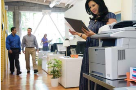
FMAudit suite queries your network print devices for information through SNMP protocol.