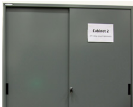
Cabinet for organized storage