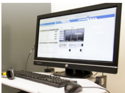
Dedicated PC and software