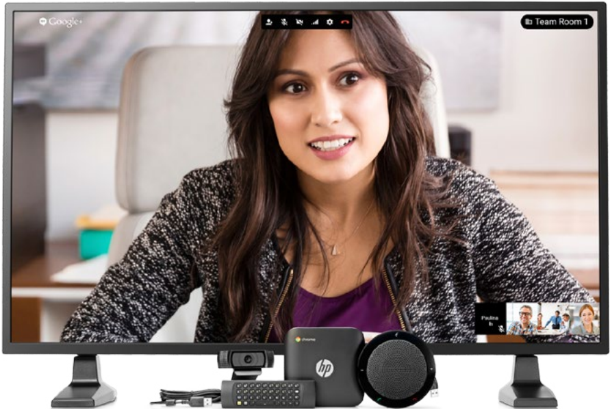
HP Chromebox for meetings components* *Shown with a large format display (sold separately)

Invite colleagues, customers or partners and get teams together from across town or from all over the world for real time video collaboration using HP Chromebox for meetings. 2