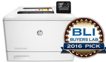
HP Inc. Color LaserJet Pro M452 Series Outstanding Color Printer for Small Workgroups