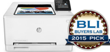
Hewlett-Packard Company Color LaserJet Pro M252dw Outstanding SOHO Color Printer