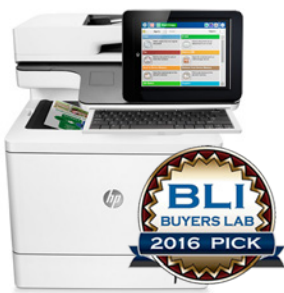
HP Inc. Color LaserJet Enterprise MFP M577 Series Outstanding Color MFP for Large Workgroups

Professional-quality documents without the wait