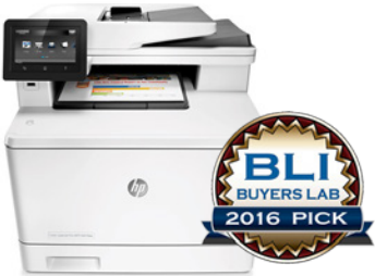
HP Inc. Color LaserJet Pro MFP M477 Series Outstanding Color MFP for Small Workgroups