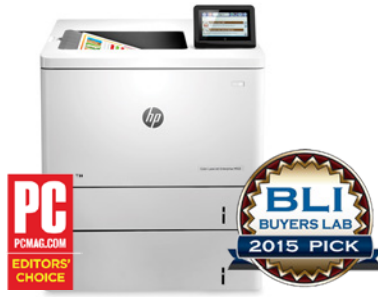
HP CLJ Enterprise M553 series Hewlett-Packard Company Color LaserJet Enterprise M553 Series Outstanding Color Printer for Mid-Size to Large Workgroups