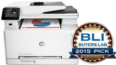
Hewlett-Packard Company Color LaserJet Pro MFP M277dw Outstanding SOHO Color MFP